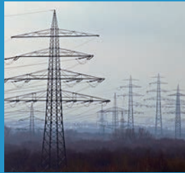
Low energy self-sufficiency rate

The Cosmo Energy Group's business (capital investment)