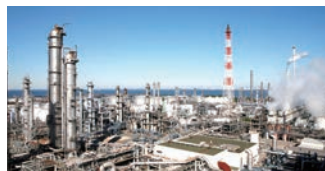
Manufacturing and sales of petrochemical products