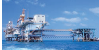
Oil development and procurement; transportation to refineries

Strength Relationships of trust with Middle East oil producing countries for approximately 50 years