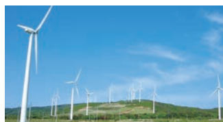
Wind power generation