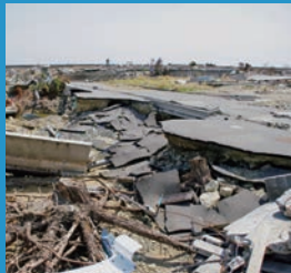
Frequent occurrence of natural disasters