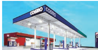
Refining and sales of petroleum products Car leasing for individuals