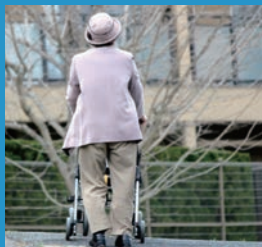
Aging population, a decline in working population