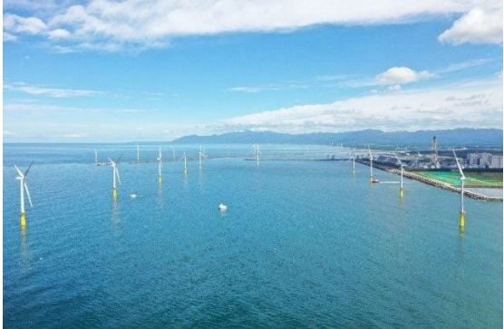
Noshiro Port Offshore Wind Farm

The Noshiro Port Offshore Wind Farm, meanwhile, began commercial operation based on the FIT scheme in December 22 of 2022 and is currently operating smoothly. The commencement of operation of the Akita Port Offshore Wind Farm marked the beginning of full-scale commercial operation of AOW's offshore wind farms. Going forward, AOW will operate, maintain, and manage both offshore wind farms for the next 20 years under an operation and maintenance structure based at Noshiro Port.