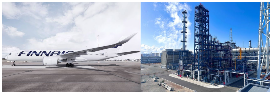
Finnair aircraft and SAF production line (on the premises of Cosmo Oil's Sakai Refinery)

Cosmo Energy Group company Cosmo Oil Marketing Co., Ltd. (hereafter, “Cosmo Oil Marketing”) and Finnair (head office: Finland) have signed a Sustainable Aviation Fuel (SAF) purchase agreement to advance sustainable air transportation. This marks the first time that Finnair has entered into a purchase agreement for SAF with a Japanese company.