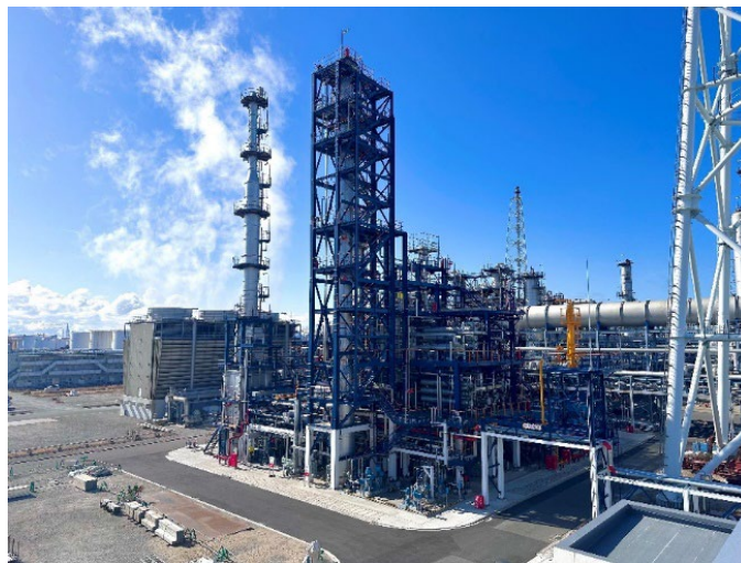
SAF production line (on the premises of Cosmo Oil's Sakai Refinery)

Recognizing decarbonization and the realization of a recycling-oriented society as key priorities, the Cosmo Energy Group remains committed to addressing societal challenges and fostering sustainable corporate development. At the same time, the Group will continue to promote the use of SAF in air transportation and contribute to the creation of a sustainable, resource-recycling society.