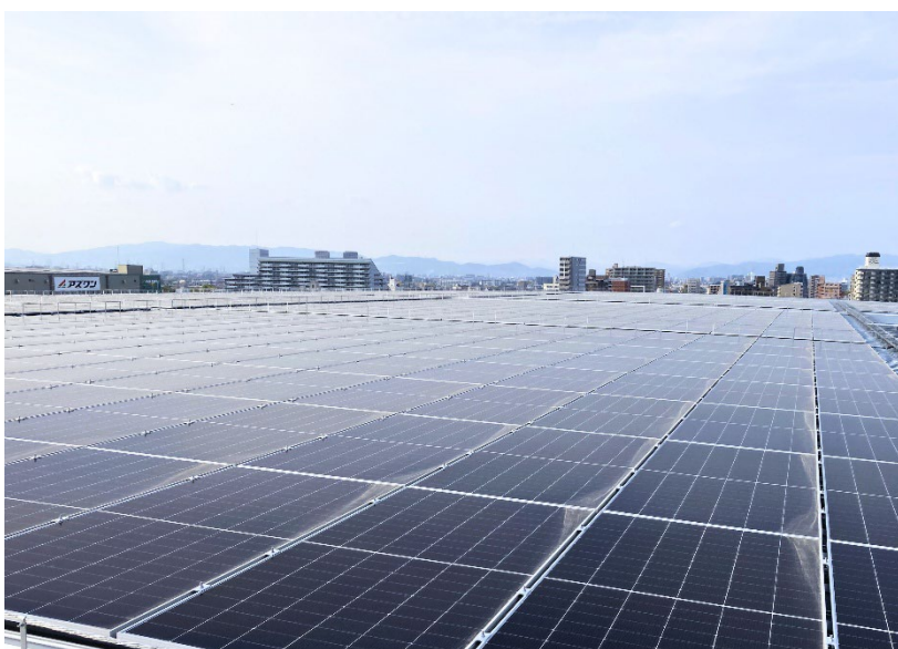
Rooftop solar power generation system owned by JAPAN BENEX

Based on the Agreement, Cosmo Eco Power will receive renewable energy over a 20-year period from two FIP-certified rooftop solar power generation systems (total capacity: approximately 5.5 megawatts (MW)) owned and operated by JAPAN BENEX in Kanagawa and Hyogo prefectures. As an aggregator 3 , Cosmo Eco Power will supply this renewable energy to its group company, Cosmo Energy Solutions Co., Ltd. (hereafter "Cosmo Energy Solutions"), which will in turn sell it to consumers as an electricity retailer.