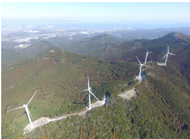
Oita Wind Farm