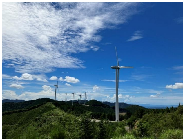
Exterior view of Chuki Wind Farm