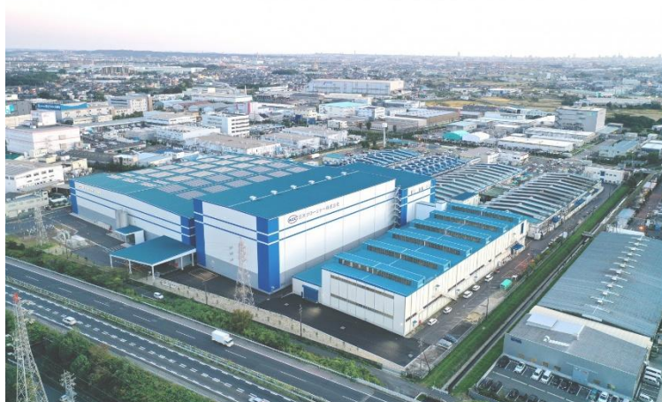
Nippon Closures' Komaki Plant

Cosmo Oil Marketing Co., Ltd. (hereafter, “Cosmo Oil Marketing”), a subsidiary of Cosmo Energy Holdings Co., Ltd., has entered into a solar power-based off-site physical Power Purchase Agreement (PPA) 1 with Nippon Closures Co., Ltd. (hereafter, “Nippon Closures”), a subsidiary of Toyo Seikan Group Holdings, Ltd. Based on the agreement, Cosmo Oil Marketing will begin supplying renewable energy-derived electricity to Nippon Closures’ Komaki Plant from April 1, 2026.