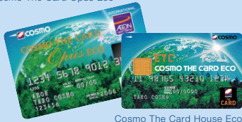
Cosmo The Card House Eco