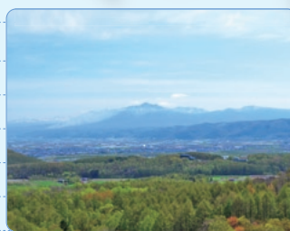
Furano in May as winter ends. The Tokachidake mountain range is visible in the distances