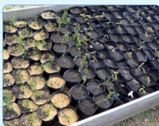
Returned cultivation kits New sprouts appeared on this day too

We would like to express our sincere thanks to everyone who nurtured seedlings for us. Many people were disappointed not to see their seeds germinate, but many have flourished with the onset of spring. Please be assured that the time and affection you devoted to them was not in vain.