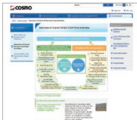
Cosmo Oil Eco Card Fund Activities http://www.cosmo-oil.co.jp/eng/envi/eco/project.html

In addition to our website which provides a detailed overview of projects, we also write a Secretariat's Report (blog) providing firsthand accounts of site visits, etc.