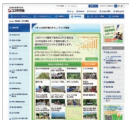
http://www.cosmo-oil.co.jp/kankyo/charity/ Home > Environment > Click Fundraising (Japanese only)

Cosmo Oil makes donations to the Cosmo Oil Eco Card Fund whenever cardholders select a project by clicking on them through the Cosmo Oil Click Fundraising site. Each cardholder can select one project a day, every day. 6,344,057 clicks (= yen) were recorded in fiscal 2011.