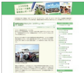
Cosmo Oil Eco Card Secretariat's Report (Japanese only) http://cosmooil.info/