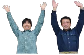
Partner: C.W. Nicol Afan Woodland Trust

The trees have been thinned and the forest has become lighter and brighter. The creatures of the forest are also delighted!