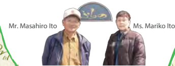
Partner: Furano Seed Planting School (LLP)

We received donations of saplings from over 1000 people and they are thriving.