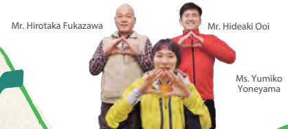
Partner: Mt Fuji Club (NPO)

We have taken a vital first step towards regenerating the natural forests of Mount Fuji so that we can leave a beautiful Mount Fuji to coming generations. We look forward to your continued support.