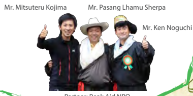
Partner: Peak Aid NPO

The forests of Nepal are recovering. Thank you for your cooperation!