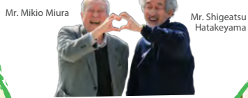
Partner: The Sea is Longing for the Forest (NPO)

The "The Sea is Longing for the Forest Tree Planting Festival" which has continued since 1989, was held again this year.