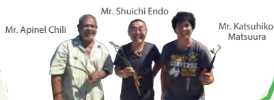
Partner: Tuvalu Overview (NPO)

We have been able to plant 10,000 mangrove trees on Tuvalu.