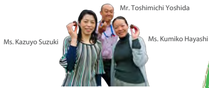
Partner: OISCA (NPO)

Reforestation of pine forests is progressing across 100ha of land including the Yuriage District in the city of Natori in Miyagi Prefecture. The trees were grown from tiny 2 mm seeds, and the largest black pine is now 220 cm tall.