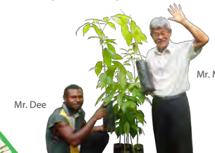
Partner: OISCA (NPO)

Tropical rain forests have been protected and are regenerating. Farmers have been given hope for their present and future.