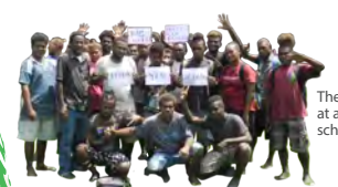
Partner: APSD (NPO)

Despite numerous difficulties as a result of a huge earthquake, we have overcome many challenges. Thank you to everyone for your support!