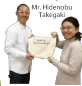
Partner: Laboratory of Earth-Conscious Life (NPO)

With your help, care of the red pine forests of Ina City in Nagano Prefecture is progressing and the forest has recovered.