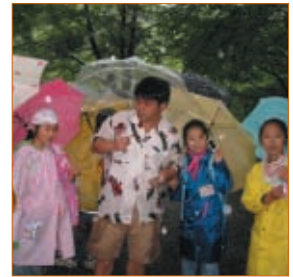
Postcards of "Album of the forests"