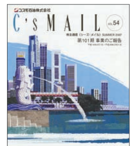
Shareholder report C's Mail