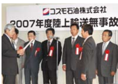
Ground Transportation Zero Accidents Award Ceremony

To ensure that more shipping companies will be able to participate in the award ceremony for fiscal 2008, we are building even stronger safety systems with partner shipping companies.