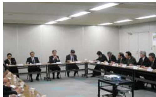
Comprehensive Safety Action Headquarters Committee

The Headquarters compiles a safety management activity performance report and its results of evaluations and safety inspections. These are presented at the annual Comprehensive Safety Action Headquarters Committee Conference, discussed at meetings of the Executive Officers' Committee, and distributed to all employees.