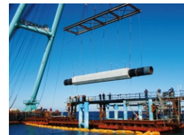
Restoration of ocean-bottom crude oil pipes

Crude oil pipes laid on the ocean bottom by the Chiba Refinery surfaced on June 19, 2008. The pipes then cracked on July 31 as they were being relaid, resulting in oil-tainted water spilling into the ocean. The director in charge of the Safety and Environment Control Department at Cosmo Oil formed the Comprehensive Disaster Countermeasures Headquarters Committee to develop measures for recovering the spilt oil and replacing sections of the surfaced piping. The pipeline was successfully restored in February 2009. The accidental surfacing was attributed to a failure during the execution of airtight inspections. To prevent a similar accident from recurring, the Group is revising methods for managing airtight inspections and systems for construction procedures based on the lessons learned from this accident.