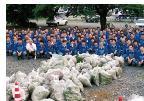
Yokkaichi Refinery employees clean the Mitaki River.

The Cosmo Oil Group organizes cleanup campaigns in the vicinity of its refineries, plants, the Research and Development Center, and offices. In June 2008, approximately 160 employees from the Yokkaichi Refinery and subsidiaries and affiliates worked together to clean up the Mitaki River. In the vicinity of the Sakaide Refinery, employees worked with employees from neighboring companies to clean roads and highways. The Group remains committed to these types of activities as a means of maintaining positive relationships with the local communities in which the Group operates.