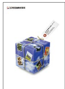
Social Contribution Activities Report

WEB Detailed information: Annual Report / Fact Book http://www.cosmo-oil.co.jp/eng/ir/annual/index.html