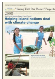
Cosmo Oil Eco Card Fund Activity Report