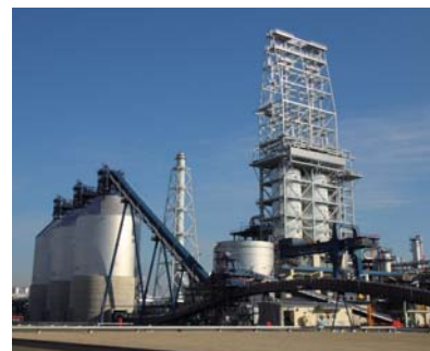
Delayed Coker Unit

Iwata: The purpose of the CBU Project was to deploy new heavy oil cracking facilities at the Sakai Refinery for the production of high-demand naphtha and diesel fuel. Both naphtha and diesel fuel are produced using heavy oil that is ordinarily turned into products such as heavy fuel oil and asphalt through distillation.