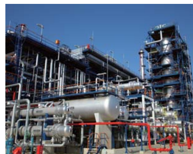
Coker Naphtha/Distillate Unionfining Unit