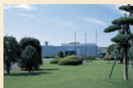
Research & Development Center

In addition to its focus on developing environmentally friendly petroleum products and more advanced manufacturing technologies, the Cosmo Oil Group is also engaged in the development of new energies and environmental technologies and in the creation of new businesses.