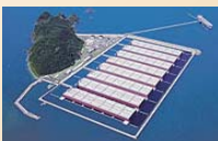
Shirashima National Oil Storage Barges

In order to ensure that energy supplies remain stable even in emergency situations, Cosmo Oil stockpiles at least 70 days worth of private crude oil reserves. Cosmo Oil is also a key participant in Japan's crude oil storage terminal managed by Shirashima Oil Storage Co., Ltd.