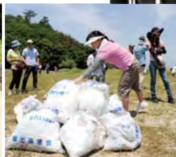
Employees and their families

◀ Shoreline cleanup Barbeque afterwards ▶