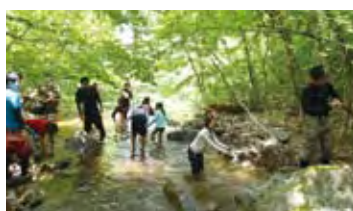
Participants enjoying the river at the Cosmo Waku Waku Camp

With the Cosmo Waku Waku Camp reaching its 20th year, a letter of appreciation was received from the National Agency for Automotive Safety & Victims' Aid. The letter expressed gratitude for inviting 980 children to participate in the camp over the last two decades. Cosmo Oil will continue to promote various kinds of social contribution activities in the future.