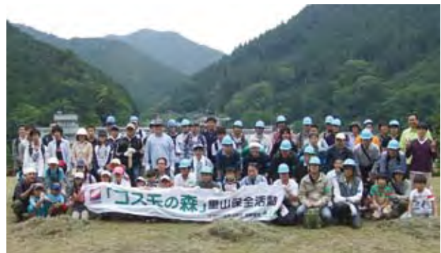
Participants in the event

The Cosmo Forest Initiative is a program that works with local governments across Japan to preserve satoyama (managed woodlands near populated areas) close to Cosmo Oil Group sites. The aim is to maintain these forests for future generations. The Sakai Refinery and Cosmo Matsuyama Oil Co., Ltd. hold Cosmo Forest conservation activities twice a year, with the participation of employees and their families. In April 2012, the Chiba Refinery held an event at a nearby Cosmo Forest for local children.