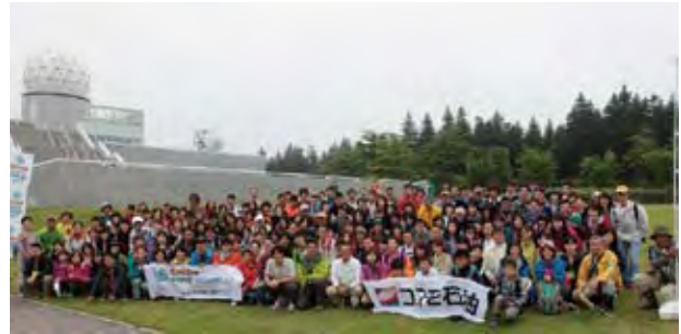
Cosmo Earth Conscious Act event

In order to further enhance communication with participants, the latest event information will continue to be provided online through a blog and Facebook.