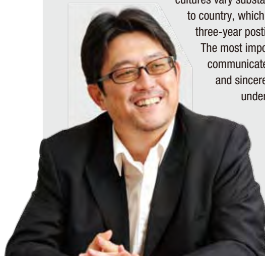
Crude Oil Group Manager, Crude Oil & Tanker Department Cosmo Oil Co., Ltd.

Our greatest mission is to ensure a stable supply of oil, which is the foundation of industry. Therefore, communication is actually the most important skill we have. Even in the main procurement region of the Middle East, social conditions and cultures vary substantially from country to country, which I learned during my three-year posting in Abu Dhabi. The most important thing is to communicate with people politely and sincerely, based on a good understanding of that country's people and culture. This is the key to securing stable procurement of oil at the best price possible.