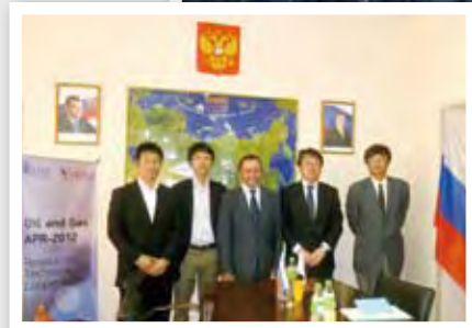
Visiting the Far Eastern Branch of the Economic Research Institute at the Russian Academy of Sciences (top) and the Far Eastern Federal University (bottom)