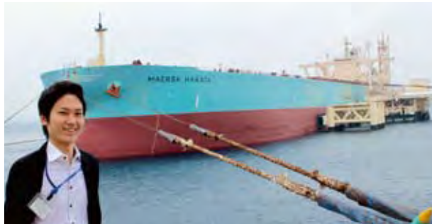
◀ Crude oil tanker: Maersk Hakata

A barrel is a unit of volume measurement for oil. In addition to market transactions, it is the unit used to express the size of an oilfield in terms of the amount of crude it can produce. It also measures refinery production capacity and the amount of petroleum products that can be refined. There are various definitions of a barrel depending on the application or country, but a standard barrel of oil is 42 U.S. gallons, or about 159 liters. The tanker shown at right can transport about 2 million barrels of crude oil, the amount the Chiba Refinery can process in about 9 days.