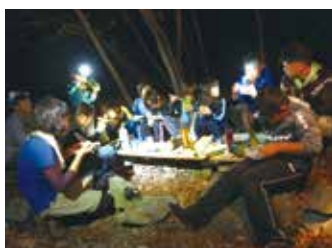
Participants enjoying an outdoor meal at the Cosmo Waku Waku Camp

Since 1993, the annual Cosmo Waku Waku Camp has been organized for elementary-school-aged children who have been orphaned due to car accidents, giving them the opportunity to experience and consider the importance of nature. Cosmo Oil remains committed to these and many other social initiatives.