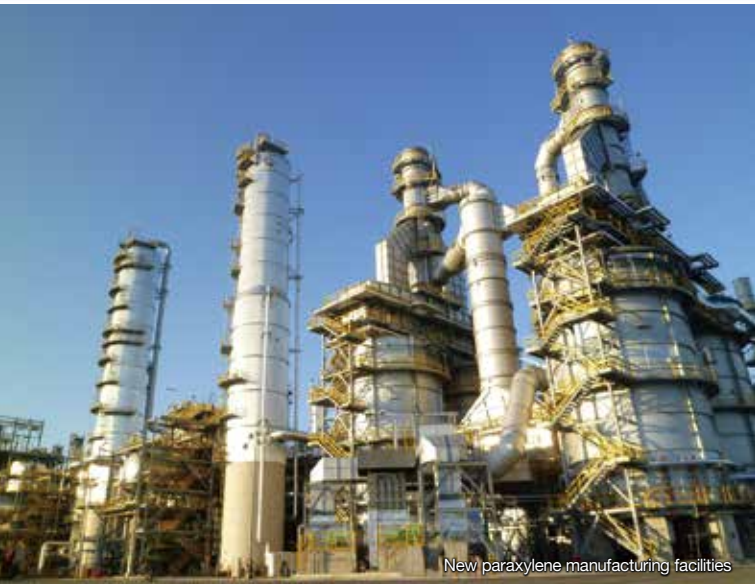
New paraxylene manufacturing facilities

Cosmo Oil is actively pursuing business outside of Japan by further strengthening alliances with IPIC and Hyundai Oilbank, as a basic strategy under the Consolidated Medium-Term Management Plan. Seeking to increase corporate value, Cosmo Oil is expanding upstream development to better position itself to secure stable energy supplies and address increased global demand for petrochemical products.