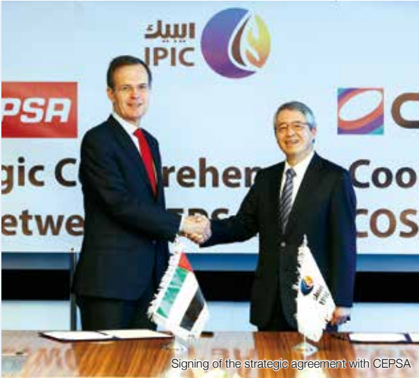
Signing of the strategic agreement with CEPSA