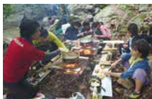
Group dinner at the Cosmo Waku Waku Camp.

The Cosmo Waku Waku Camp is held every summer for elementary-school aged children who have lost parents to traffic accidents. The nature discovery camp is held over three days and was first launched in 1993. In fiscal 2014, the camp took place at a campsite in Tsuru City, Yamanashi Prefecture for 38 children.