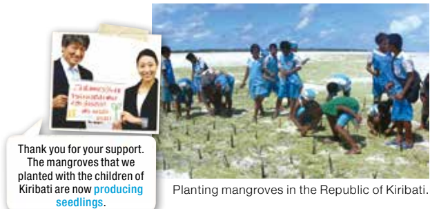
Planting mangroves in the Republic of Kiribati.